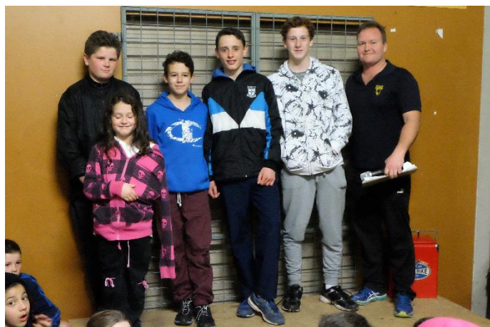
Some of this week's coaches' award winners