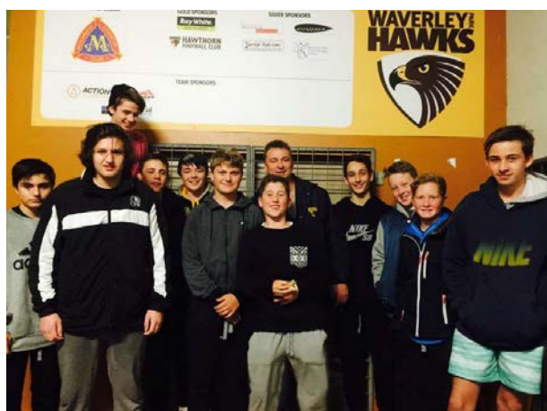
Under 14 Gold