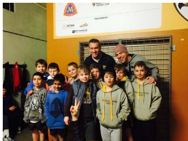
Under 9 Gold