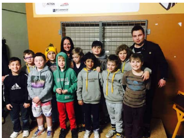
Under 9 Brown