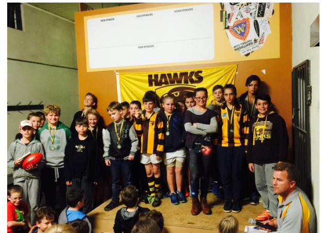
Round 4/5 Coaches' Award winners