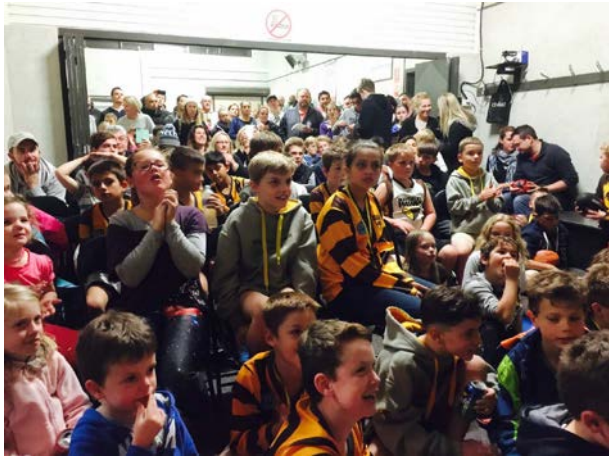
Big crowd for the Round 5 After Match