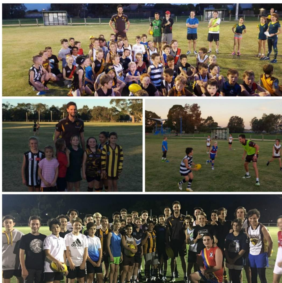
What a treat it was to have Jack Gunston from Hawthorn at training last week helping out with our Under 9 girls, Under 9 boys and Under 14 teams.