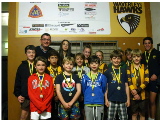
All the Anzac Medallists with Daniel Andrews, State Leader of the Opposition